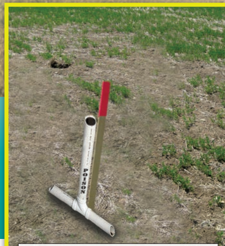
Bait stations are an effective baiting tool on border areas / buffer strips

For retail sale to, and use only by: Certified Applicators, or persons under their direct supervision and only for those uses covered by the Certified Applicator's Certification.