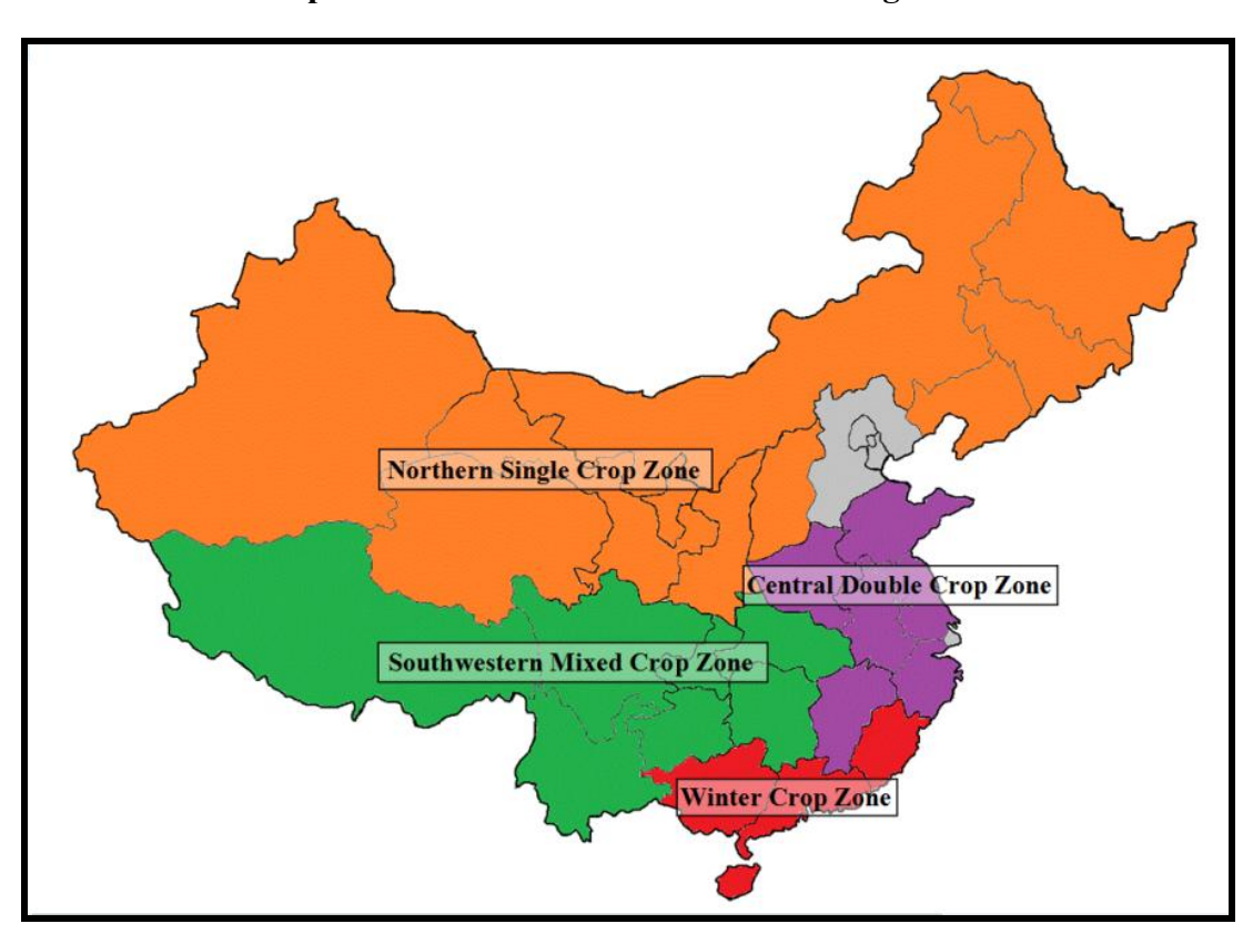
Map of Mainland China's Potato Growing Zones

China has four main potato producing zones. Sichuan, Gansu, Guizhou, Yunnan, and Inner Mongolia are the largest potato producing provinces in China, accounting for about 60 percent of China's total fresh potato production.